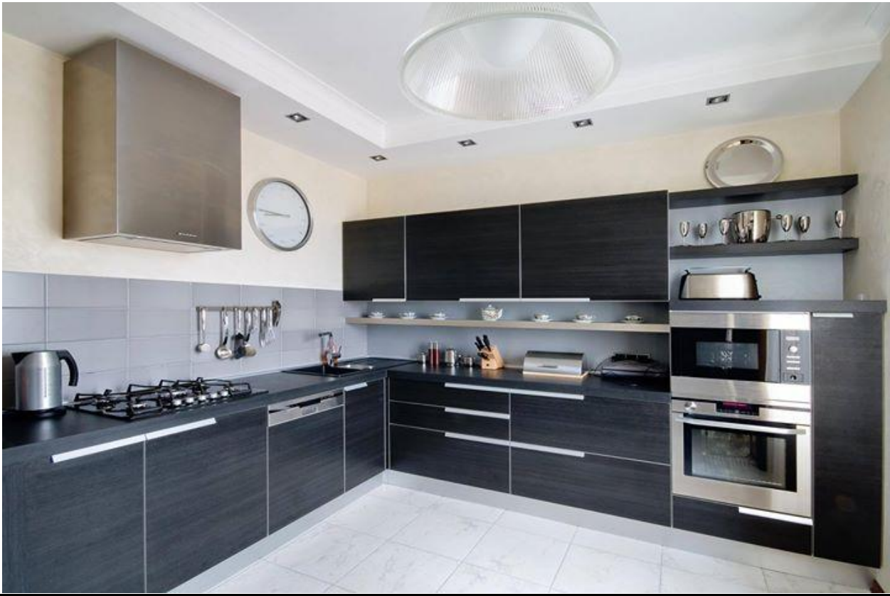
Sample Photo, but should be of approved shade