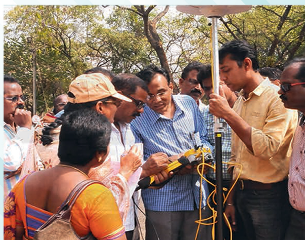
Participants understanding use of GIS tools

IT infrastructure in NIRDPR has an excellent state-of-the-art technology with a computer centre having dedicated connectivity of Internet and Intranet. The institute has been recognised as the Centre of Excellence by the Department of Personnel and Training, Government of India for its IT infrastructure. There are two well-equipped computer labs that meet the current requirements of the office and also caters to training and research activities of the Institute.