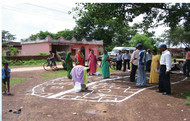
Community involved during Participatory Rural Appraisal (PRA) Exercise

The Institute also organises Training-cum-Workshop for Members of Legislative Assembly (MLAs) and Members of Legislative Councils (MLCs) with the objective to familiarise the members with new initiatives and strategies in rural development programmes and aid in the formulation of right policies and programmes for sustainable rural development.