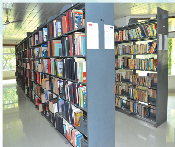
The library with rich collection of books on various rural themes

The Institute brings out a quarterly 'Journal of Rural Development', a monthly NIRDPR Newsletter 'Pragati' in English and Hindi which highlights the recommendations of various training programmes, seminars, workshops and important events which are undertaken by NIRDPR. Besides, the Institute carries out more than 29 publications in the form of articles, papers, journals, books and book reviews, etc. The Institute has subscribed to 101 Indian and foreign journals, 16 journals on exchange and complimentary basis. 30 Newsletters are received from different rural development institutions.