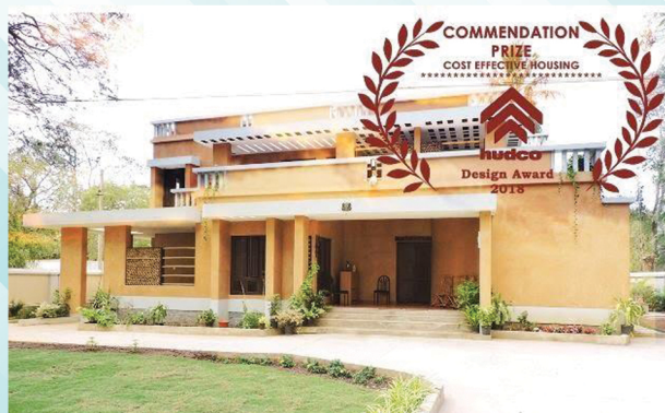
DG Bungalow - A sustainable housing model

The Institute has been promoting adoption of sustainable housing technologies to combat climate change and other environmental challenges, otherwise triggered by the conventional buildings.