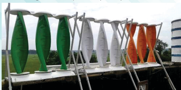
Solar-wind hybrid energy system installed at NIRDPR

The solar energy systems ranging from 0.3 KW to 2 KW capacities have also been installed in 26 schools located in Mahbubnagar and RangaReddy district in Telangana for lighting and cooling facility, in association with Green Urja Technologies and Systems (GUTS).