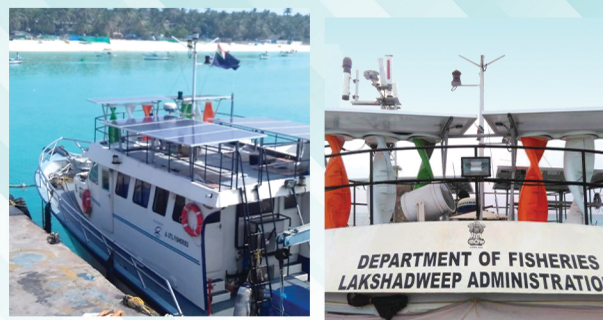
Solar Wind Hybrid plants at Kavaratti, Lakshadweep on MFV BlueFin & fishing boats

NIRDPR is promoting a hybrid system, i.e., solar-wind mill based on distributed renewable energy system, optimised for on and off-grid installations. In collaboration with the National Fisheries Development Board (NFDB), Hyderabad. The technology is being transferred and promoted for the development of the fisheries sector and has been installed at NFFBB, Bhubneswar, Chandil Dam, Jharkhand and Kavaratti, Lakshadweep.