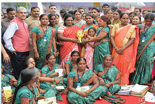
Hon'ble Governor Telangana with SHG Women under DAY- NRLM

The Resource Cell for DAY-NRLM facilitates capacity building and research activities for promotion of rural livelihoods. The cell also develops appropriate resource material for capacity building of CBOs and SRLM staff. It provides active support to the SRLMs in developing resource blocks/model blocks. The RSETI Project Cell is the nodal agency for scrutinising the infrastructure proposals of various sponsoring banks and for release of funds by the MoRD.