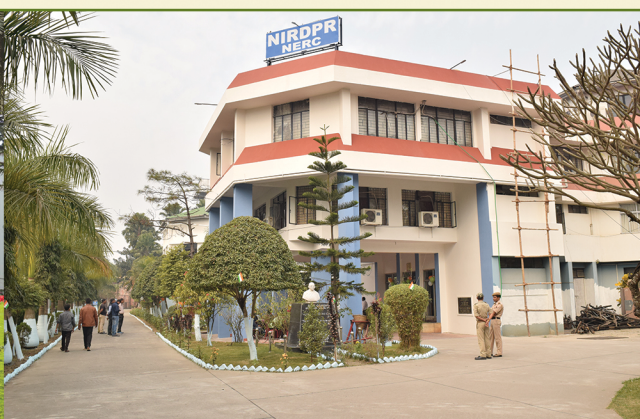
NIRDPR-NERC Campus at Guwahati