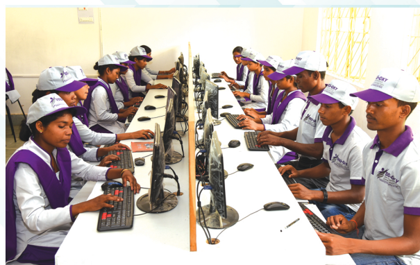
Candidates being trained under DDU-GKY

NIRDPR is one of the Central Technical Support Agency (CTSA) of MoRD for policy advocacy and administering the Standard Operating Procedures of DDU-GKY. The Institute oversees the implementation of the DDU-GKY programme across 17 States and 4 Union Territories and is playing a central role in providing training and implementation support to States and Project Implementing Agencies (PIAs).