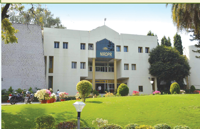
NIRDPR Campus at Hyderabad

As a 'think-tank' for the Ministry of Rural Development, NIRDPR, while acting as a repository of knowledge on rural development, would assist the Ministry in policy formulation and choice of options in rural development to usher in the change.