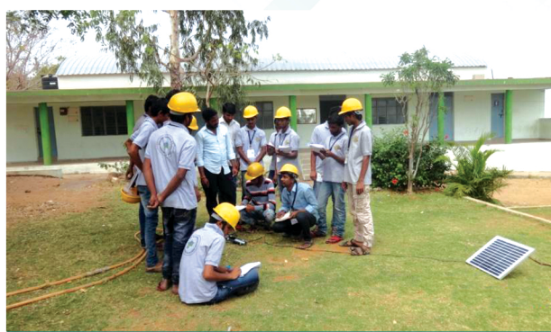
Innovative Skilling and Livelihoods