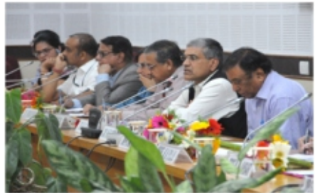
Director General, NIRD&PR, addressing the participants of PGDRDM workshop

development communication; skill development; national flagship programmes of MoRD and among others, as listed trimester-wise. Based on the programme design and its objectives, the following courses, as shown in the next page, seek to fulfil the objective of the classroom component that is presented in three parts. Field visits and Field Attachment /Organisational Internship(6 weeks) are interspersed with the classroom component. Other associated academic activities equaling ten weeks duration at different time points include