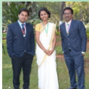
Toppers of PGDRDM Batch-11

Certain Number of top meritorious students may be awarded NIRD&PR's Scholarship based on their performance in the Trimester Examination. The North Eastern Council, Shillong, will be approached for giving fellowships to economically backward students of North Eastern states.