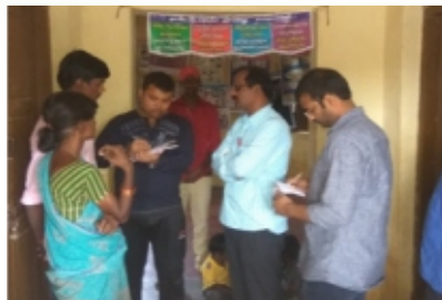
PGDRDM students during their field exposure visit to village

As part of the PGDRDM curriculum requirement, the students are sent on short and long field visits for field work and field attachment (Rural Organisational Internship) of six weeks at the end of the second trimester in small groups. This component carries a weightage of 2.0 credits. The short field visits of 2-3 days duration numbering 25-30 visits (about 12 weeks) are arranged across the courses throughout the Programme. The short and long field visits of two-three days spread over all the three trimesters provide the students with core development and management insights while imparting analytical skills for planning and managing rural development programmes.