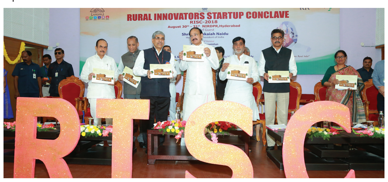
Hon'ble Vice President of India Shri M. Venkaiah Naidu along with other dignitaries releasing Compendium on 'Gram Panchayat and Anganwadi Building Designs' during the inaugural ceremony of RISC- 2018 at NIRD&PR

A platform for Innovative Ideas for Rural Transformation