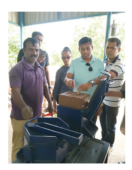
Hands-on experience on Compressed Stabilised Earth Block making

The module also included the "Hands on Experience" at the National Rural Building Centre, Rural Technology Park, NIRD&PR where the participants were exposed to making of compressed brick blocks, arches, rat-trap bond walls and other technologies through vernacular and cutting edge technologies.