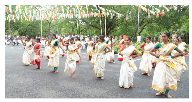
Students of BVB Vidyashram, NIRD&PR taking part in march past (above) and performing dance on the occasion of Independence Day