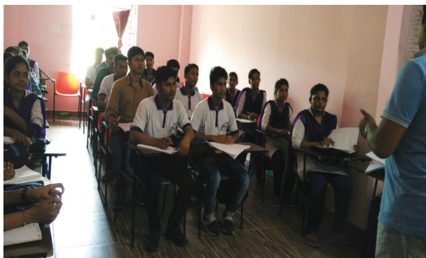
Passive learning class