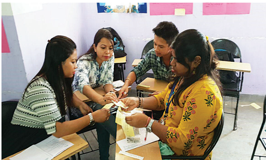
Training session in progress

a context where employers lament that college graduates are educated, but not employable due to lack of requisite skills that industry is looking for.