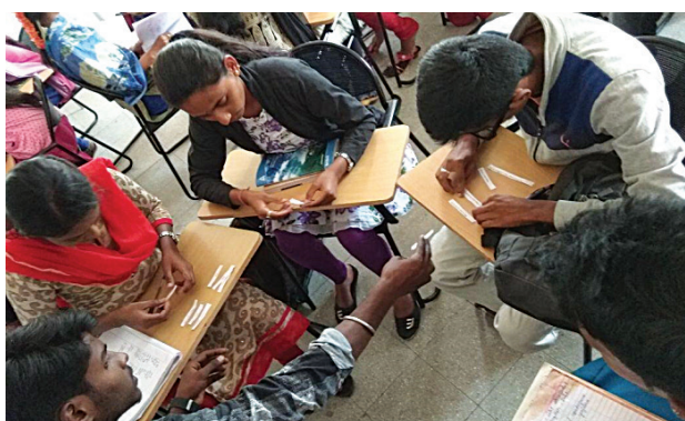
DDU-GKY Students in skill training theory class delivered by trainers who have attended NIRDPR's Kaushal Praveen ToT