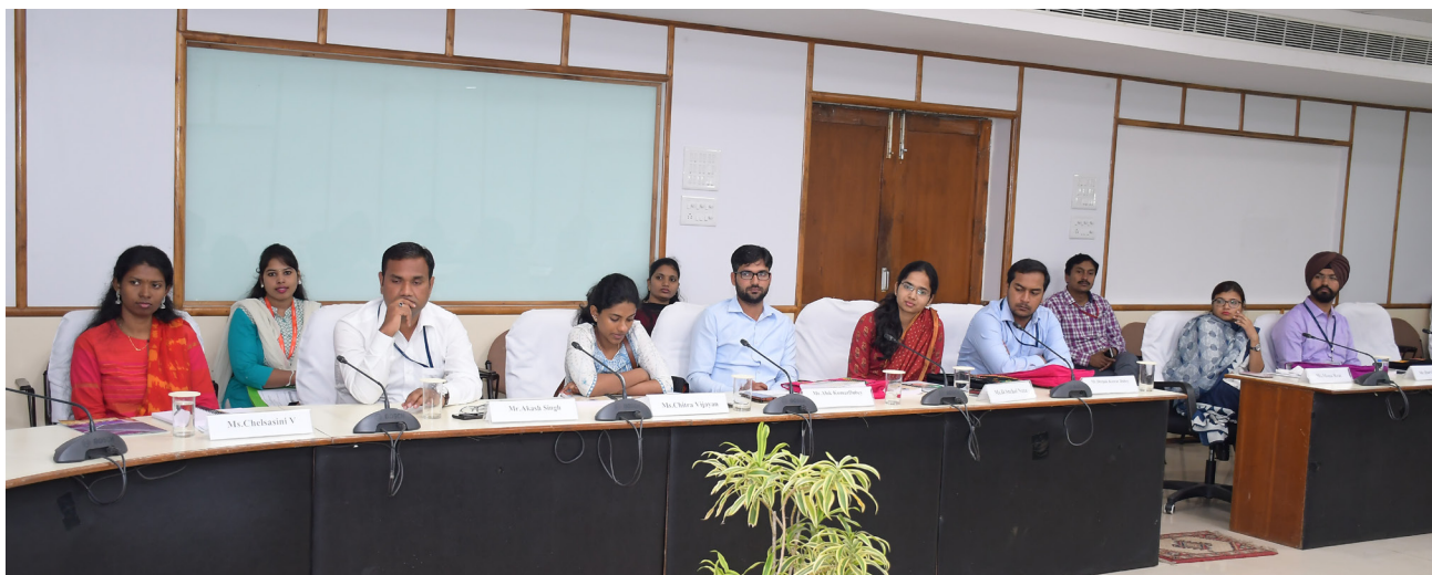
Trainee IAS officers during a session as part of their winter study tour at the National Institute of Rural Development and Panchayati Raj