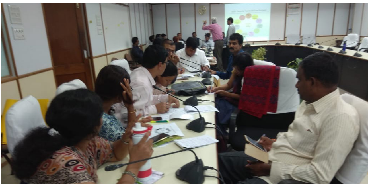
Lab session and group work in progress