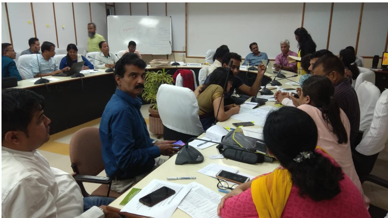
Lab session and group work during the training programme

an interactive lab session and group work exercises as an integral part, along with the theoretical lectures. GPDP has been mandated by both MoRD and MoPR to capture the holistic and integrated annual action plan of the Gram Panchayat. This further widens the scope and requirement of such labs in the future.