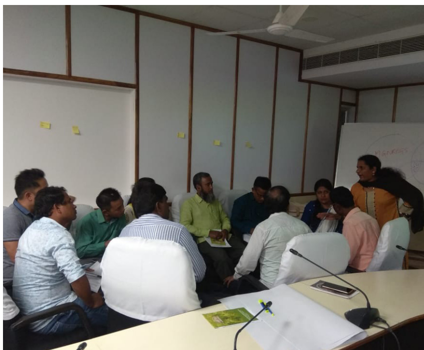
Lab session and group work in progress

CWE has plans to further improve the contents and conduction of the lab sessions on MGNREGA and GPDP in the upcoming training programmes. It would be gradually developed as a standard pedagogy, where all training programmes of the Centre would have