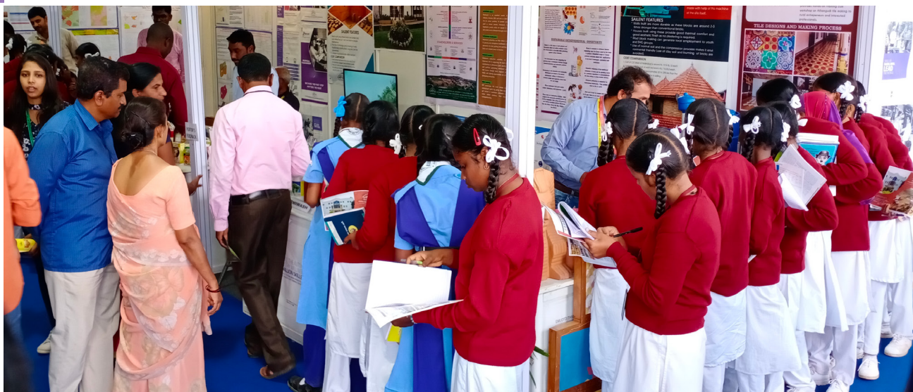
Visitors at the NIRDPR stall at the 107 th Indian Science Congress

The 107 th Indian Science Congress (ISC) was held at the University of Agricultural Sciences in Bengaluru, Karnataka from 3 rd -7 th January, 2020. The event was inaugurated by Shri Narendra Modi, Hon'ble Prime Minister of India on 3 rd January, 2020. The theme for this year's science congress was "Science & Technology: Rural Development". During the inauguration, PM Modi launched the Indian Science Technology