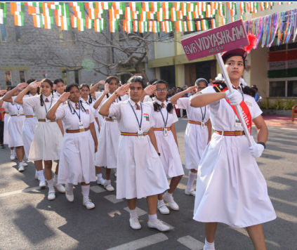
The march past by students of Bharatiya Vidya Bhavan's Vidyashram