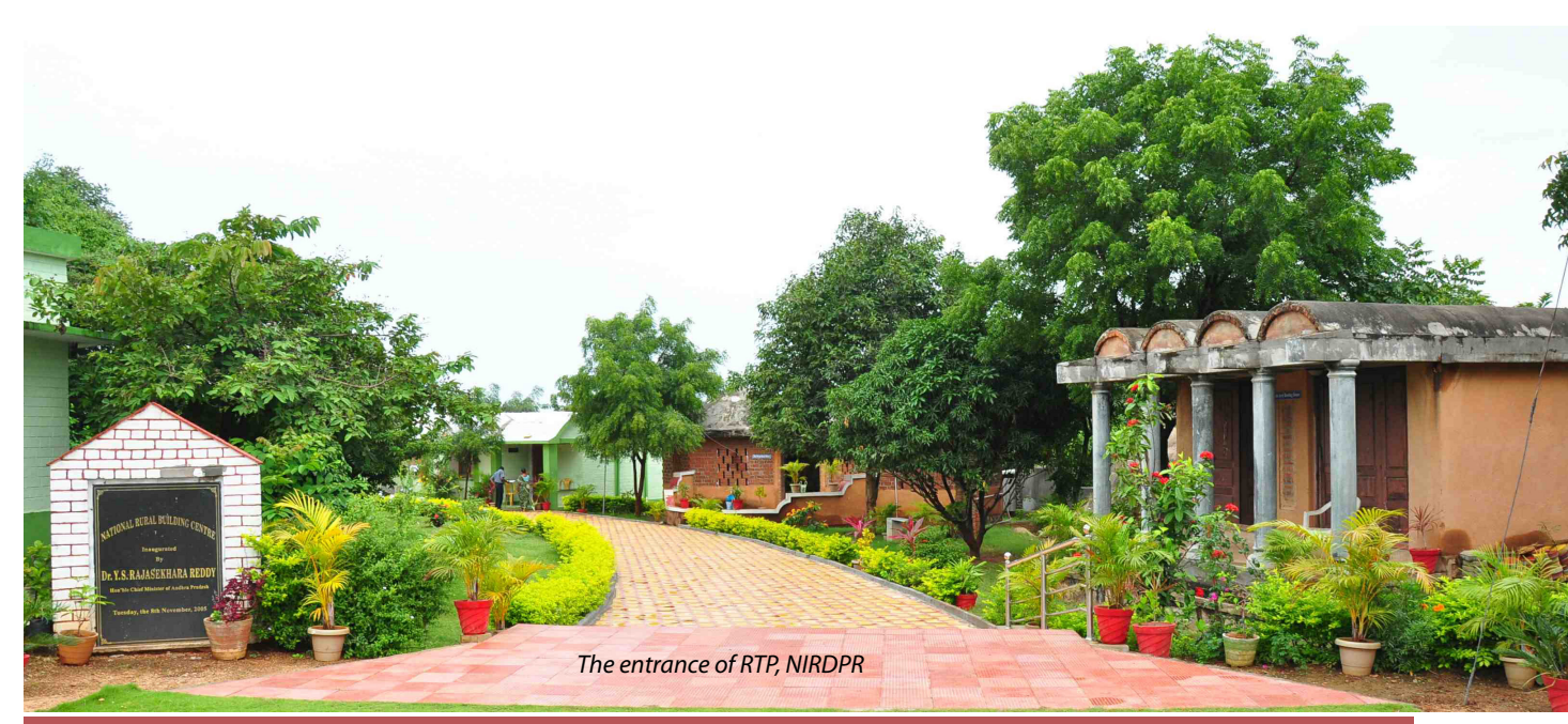
Promoting appropriate technologies and entrepreneurship in rural areas: initiatives of the Rural Technology Park, NIRDPR

Globally, the role of science, technology and innovations is being considered as a vital component for promoting national growth. In India, use of science and technology for addressing the developmental issues was actively considered with the introduction of science policy framework brought out by the government in 1958. Over the years, several steps have been introduced by the government in furthering this goal. One of the recent steps in this direction