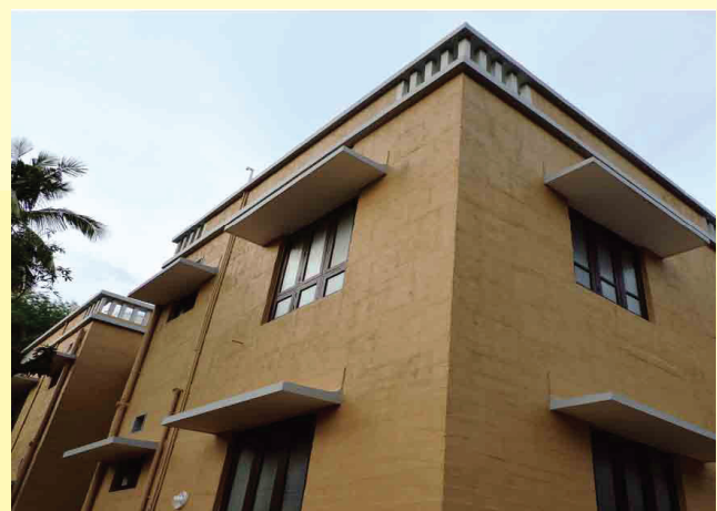
Eco-friendly construction technologies were used for the construction of Director General's bungalow on the NIRD&PR campus. The house warming ceremony was held on June 24, 2018.