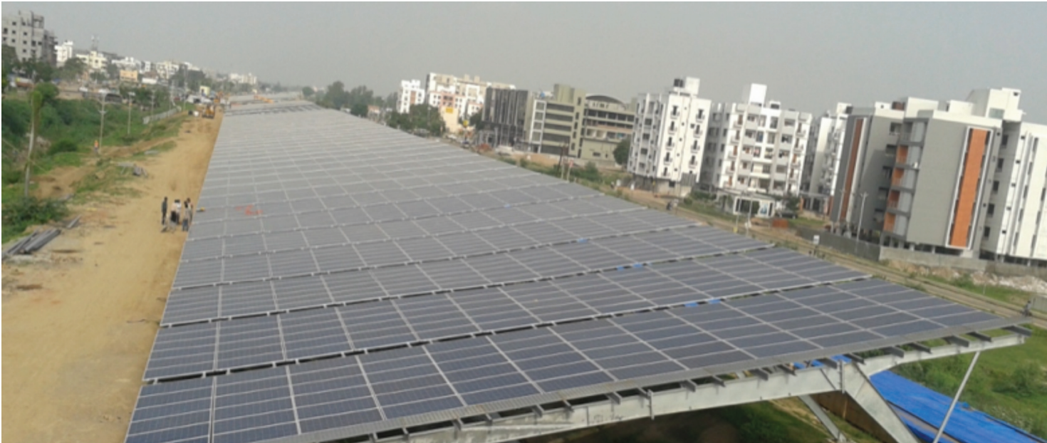
10 MW grid connected Canal Top Solar Power project in Vadodra, Gujarat