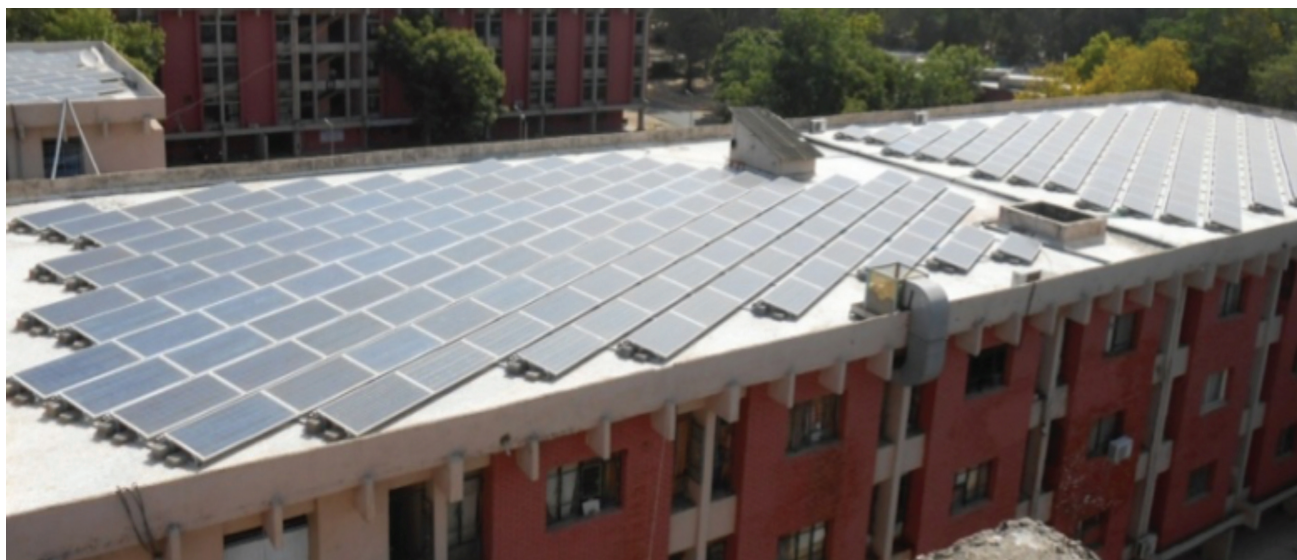
5 MW Solar Rooftop project in Gandhinagar, Gujarat

Habitat, 4. The National Mission on Water, 5. The National Mission for Sustaining the Himalayan Ecosystem, 6. The National Mission for a Green India, 7. The National Mission for Sustainable Agriculture and 8. The National Mission for Strategic Knowledge for Climate Change.