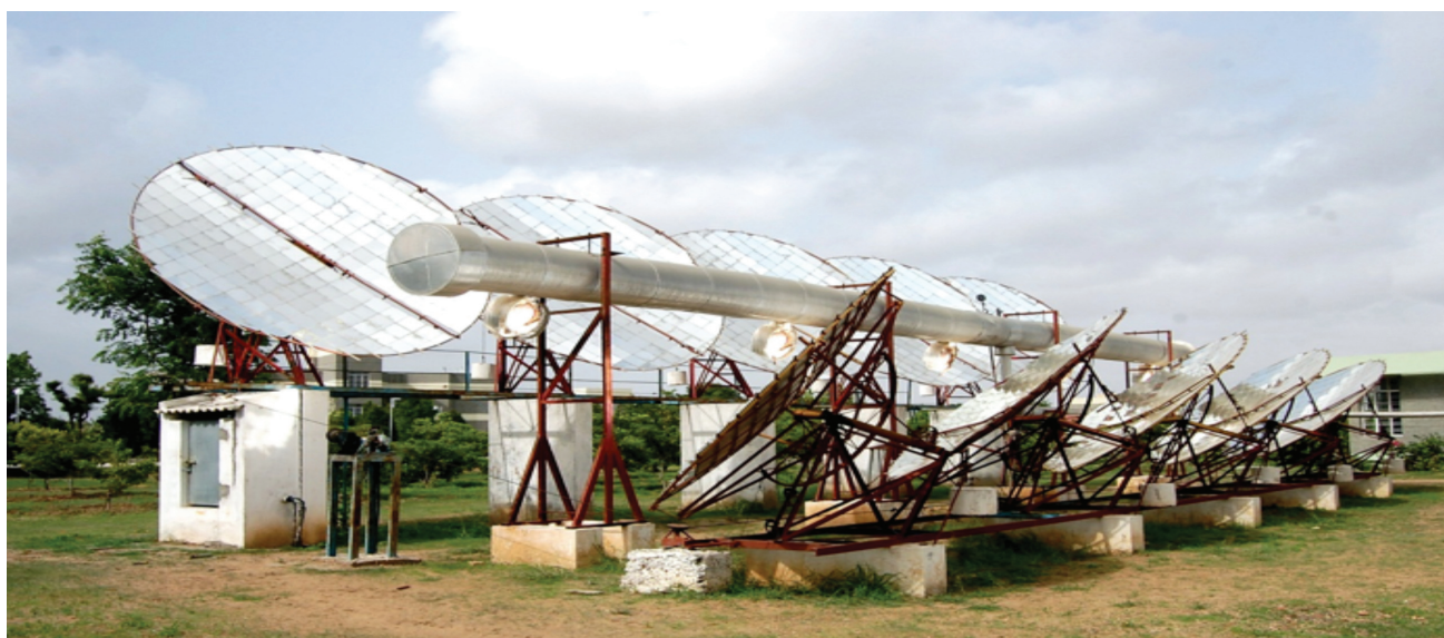
Solar Steam Cooking System at Veerayatan Vidyapeeth Kutch, Gujarat

fertiliser use efficiency include applying nutrients according to plant needs, placed correctly to maximise uptake, at an amount to optimise growth, and using the most appropriate source (IFA, 2009). Poor soil fertility limits the ability of plants to efficiently use water (Bossio et al., 2008). This low water utilisation is partly because crops cannot access it, due to lack of nutrients for healthy root growth (Penning de Vries and Djiteye, 1982). ( http://www.worldbank.org/en/news/feature/2013/06/19/india-climate-change-impacts ).