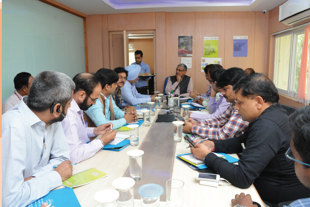
Officials of Press Information Bureau