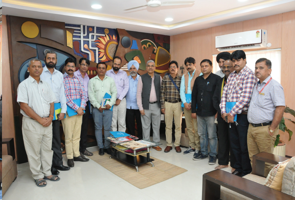
from Chandigarh Visiting NIRD&PR