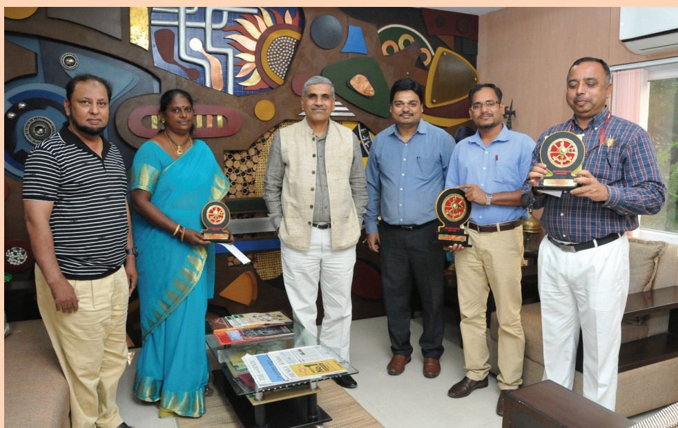
Winners of Essay Writing Competitions on Vigilance Week Awareness Programme organised by NIRD&PR, receiving Mementos from the Director General