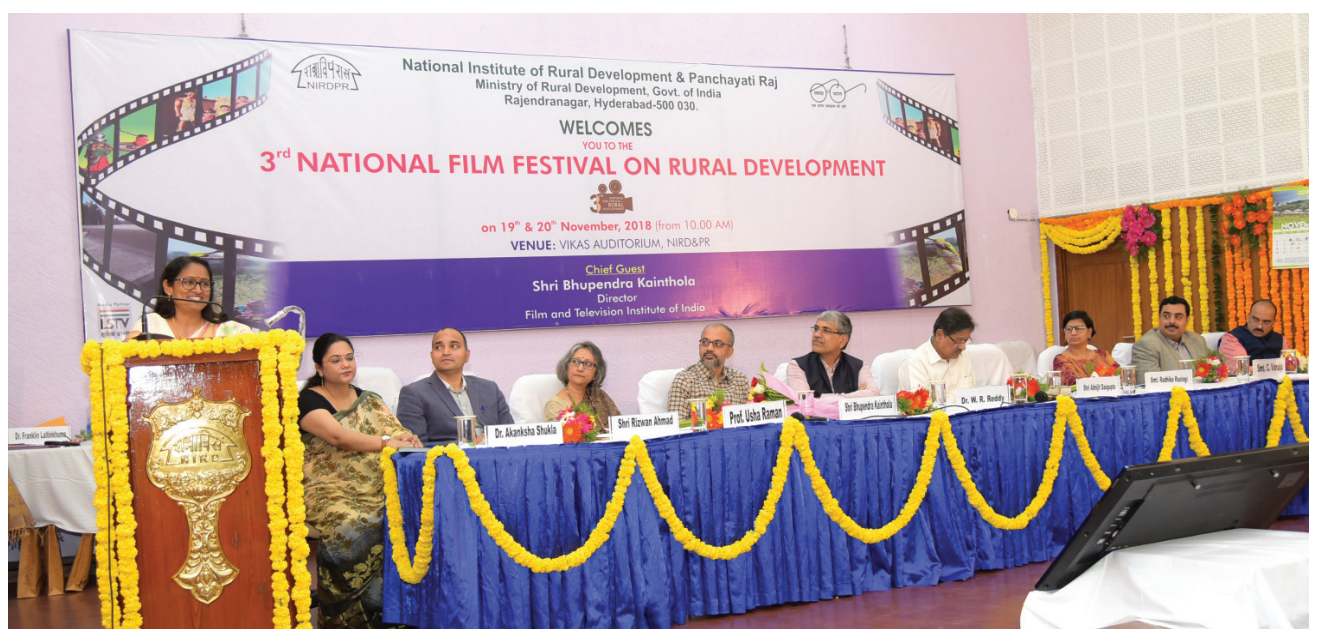
Smt. Radhika Rastogi, IAS, Deputy Director General, NIRDPR addressing the gathering during the inaugural of 3<sup>rd</sup> National Film Festival on Rural Development

The Centre for Development Documentation and Communication (CDC) organised the 3<sup>rd</sup> National Film Festival on Rural Development at National Institute of Rural Development and Panchayati Raj (NIRDPR) on November 19<sup>th</sup> and 20<sup>th</sup>, 2018.