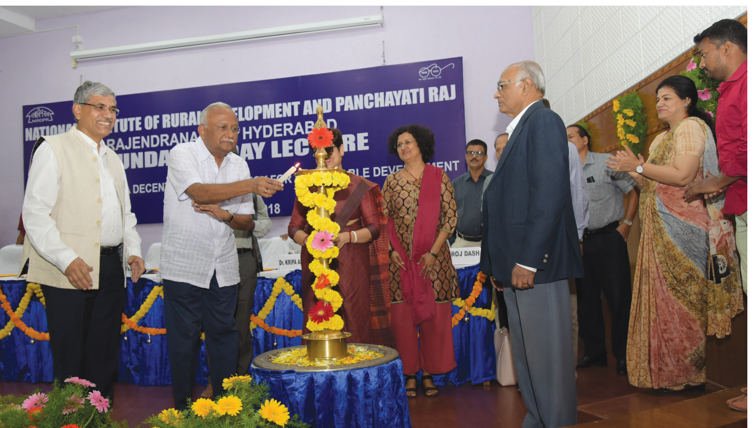
Shri S. M. Vijayanand, IAS(retd.) and former Director General of NIRDPR, lighting the lamp in the presence of other dignitaries during the Foundation Day celebrations

The National Institute of Rural Development and Panchayati Raj (NIRDPR) commemorated its Foundation Day on 9<sup>th</sup> November, 2018. The theme for the Foundation Day was 'People's Planning: A Decentralised Strategy for Sustainable Development', in line with the nation-wide People's Plan Campaign for Gram Panchayat Development Plan (GPDP), launched by the Ministry of Panchayati Raj and the Ministry of Rural Development on 2<sup>nd</sup> October, 2018.