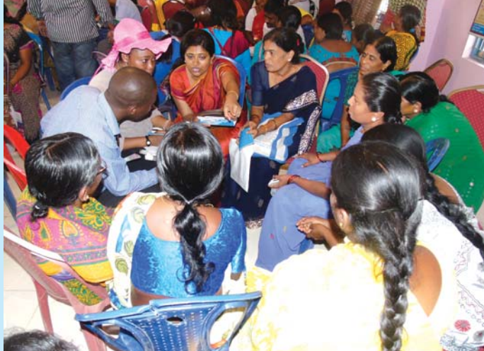
Interaction with Elected Women Representatives

Development and Panchayati Raj, Karnataka invited all the participants and had discussion on the field visit learning of the participants.