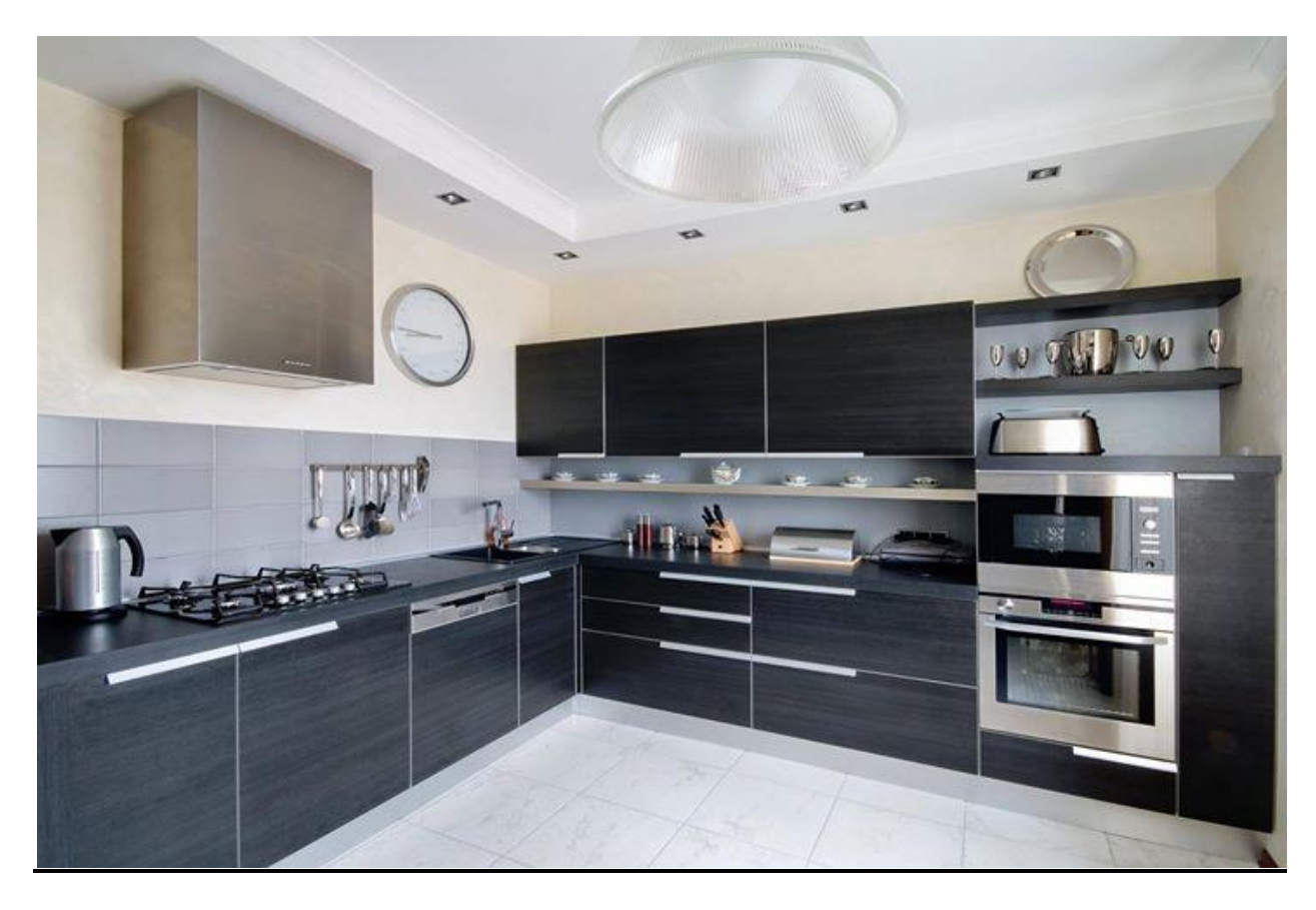
Sample Photo, but should be of approved shade