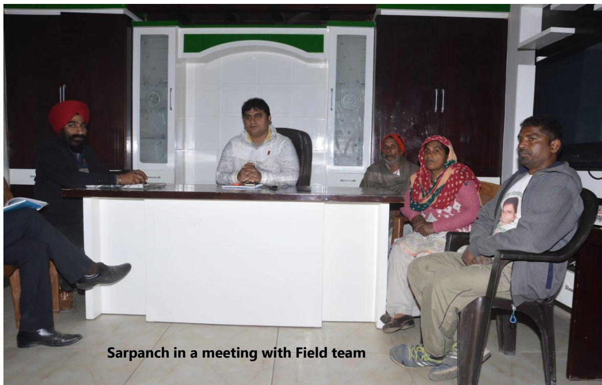
Sarpanch in a meeting with Field team

After he elected as Sarpanch in 2016, he got the opportunity to implement all those ideas and plans, such as those related to sanitation, health and the environment. He played a key role or could say solely changed the scenario of the village and established Jhattipur as a role model.