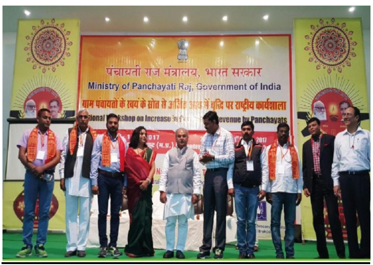
With Hon. Minister of Ministry of Panchayati Raj