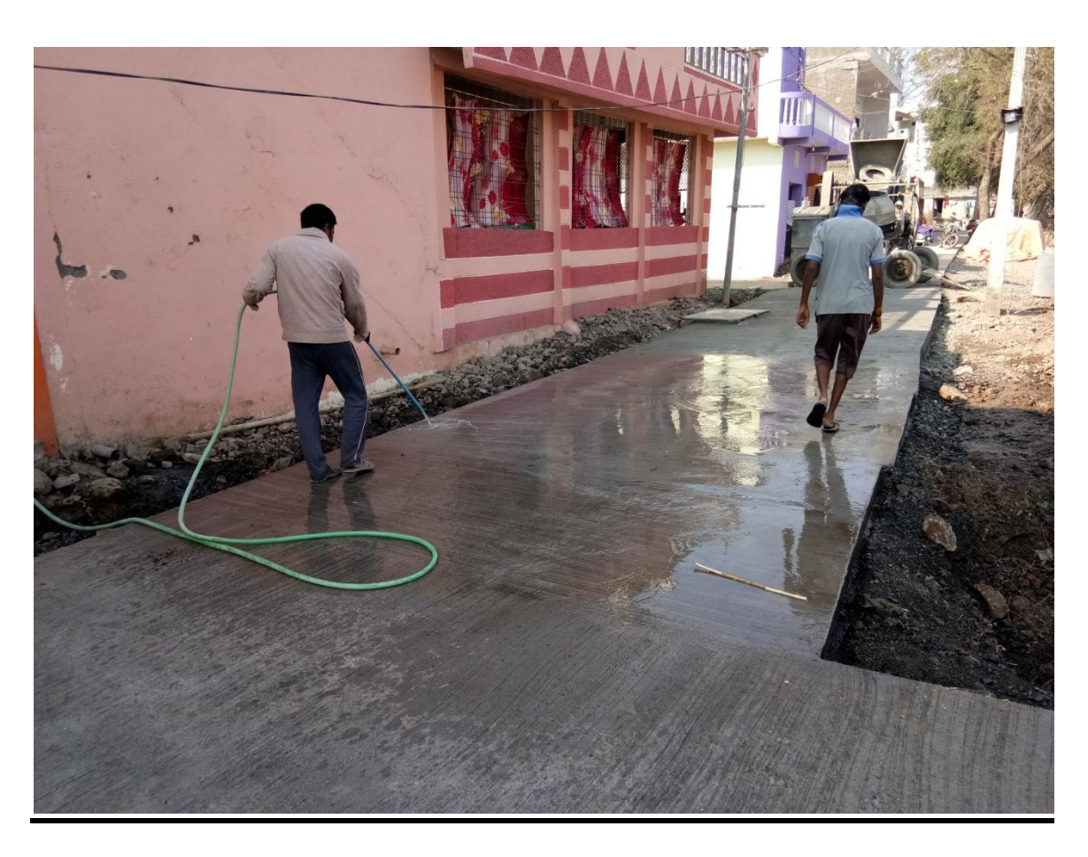
Constructing CC Roads