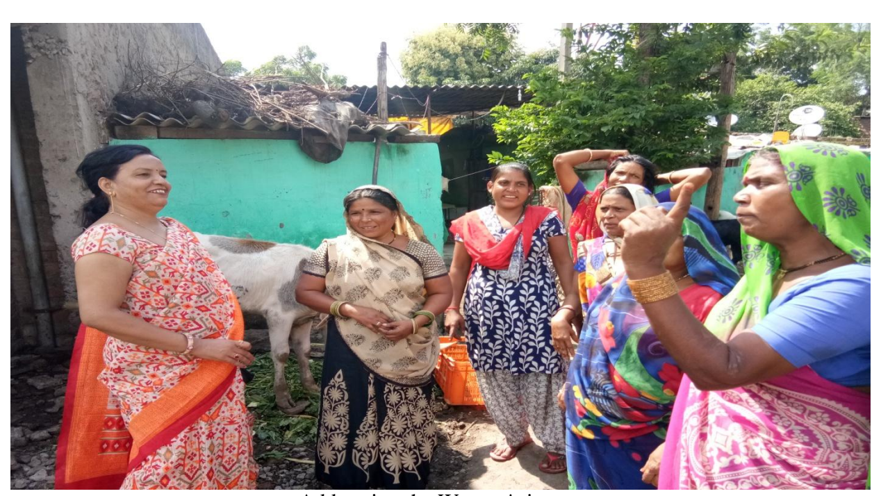
Addressing the Women's issues