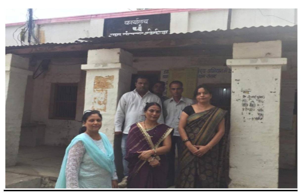
Visit to Panchayat