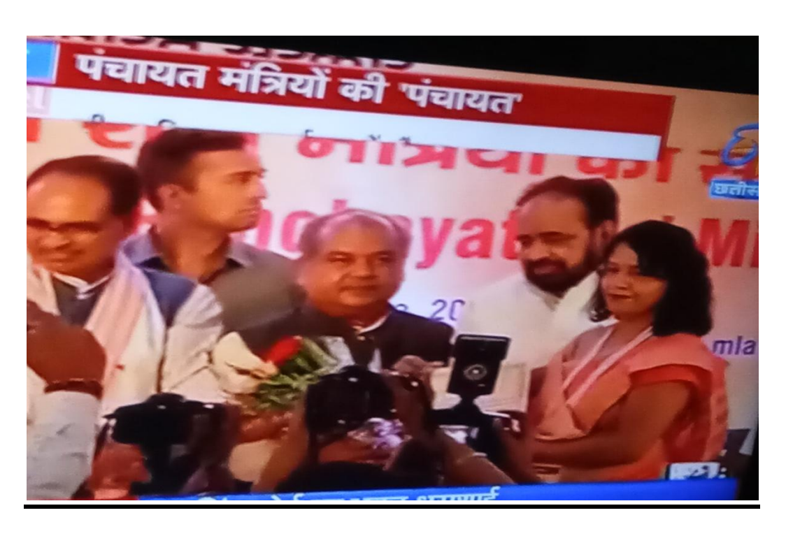
With Hom. Minister & CM