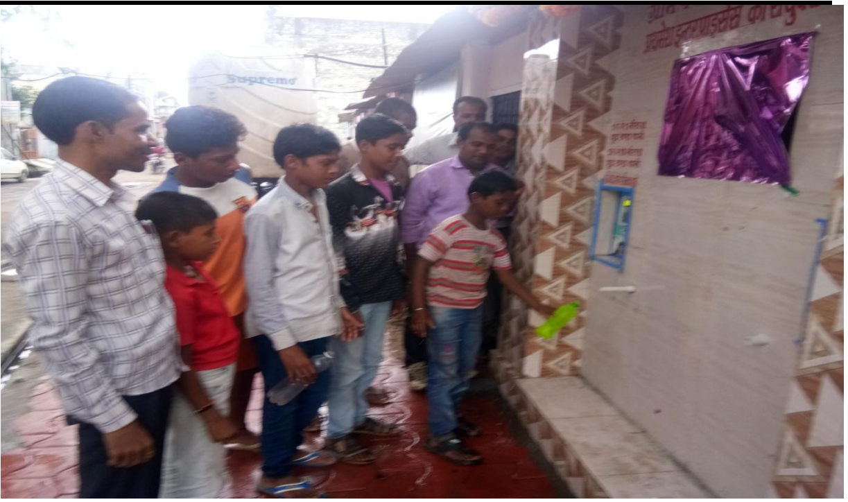
Clean & Safe Drinking Water