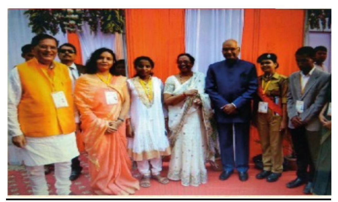
With Hon. President of India