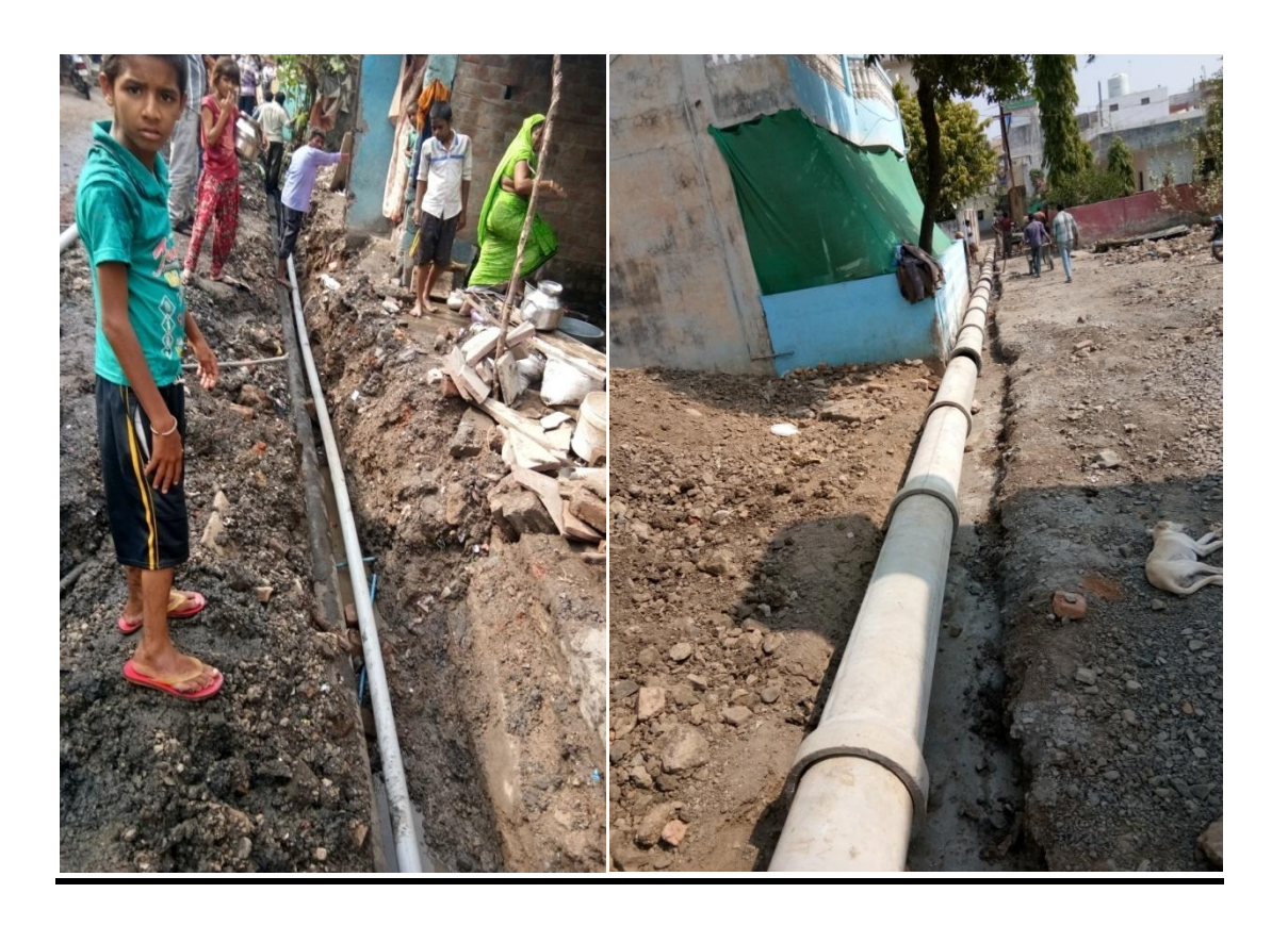
Underground drainage System