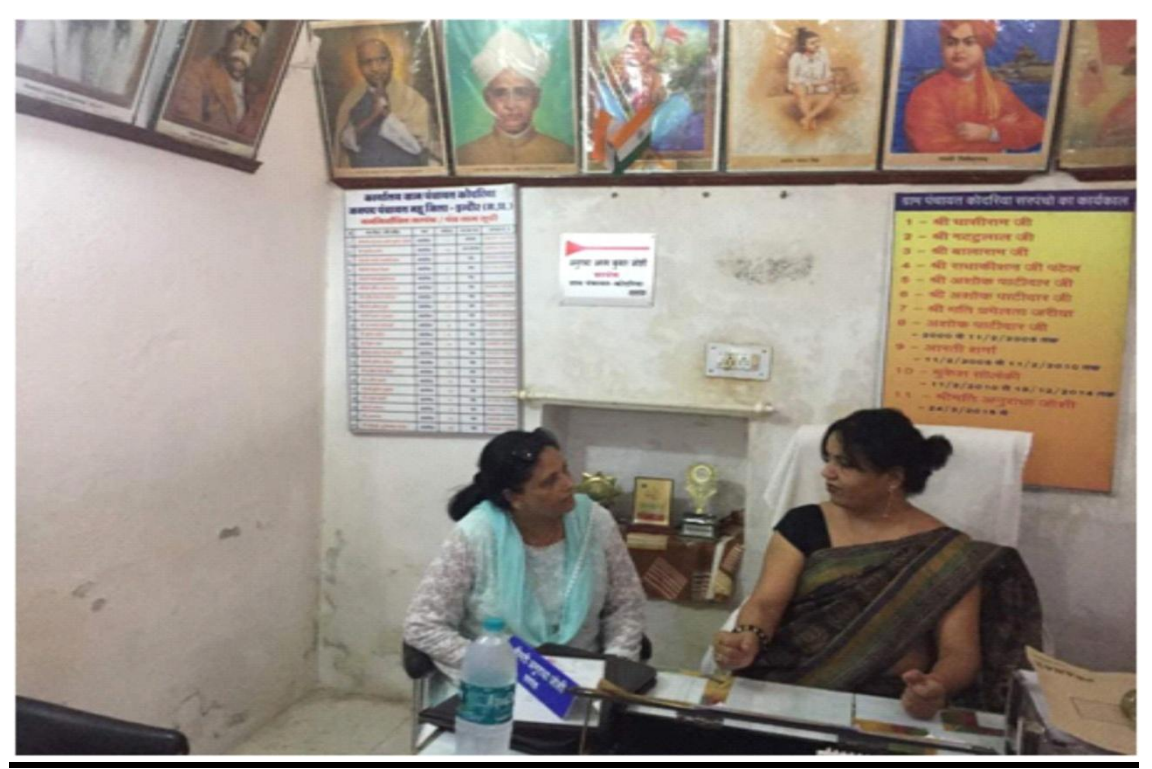
Interview in Progress