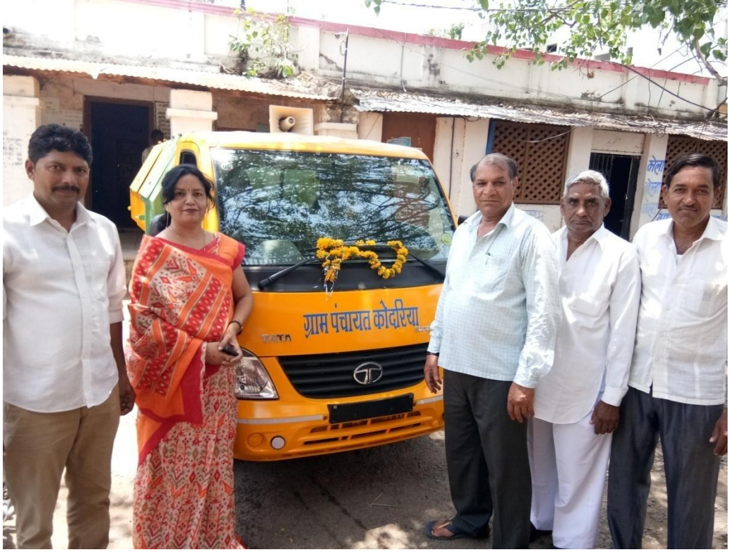
Efforts for a Swatch Panchayat