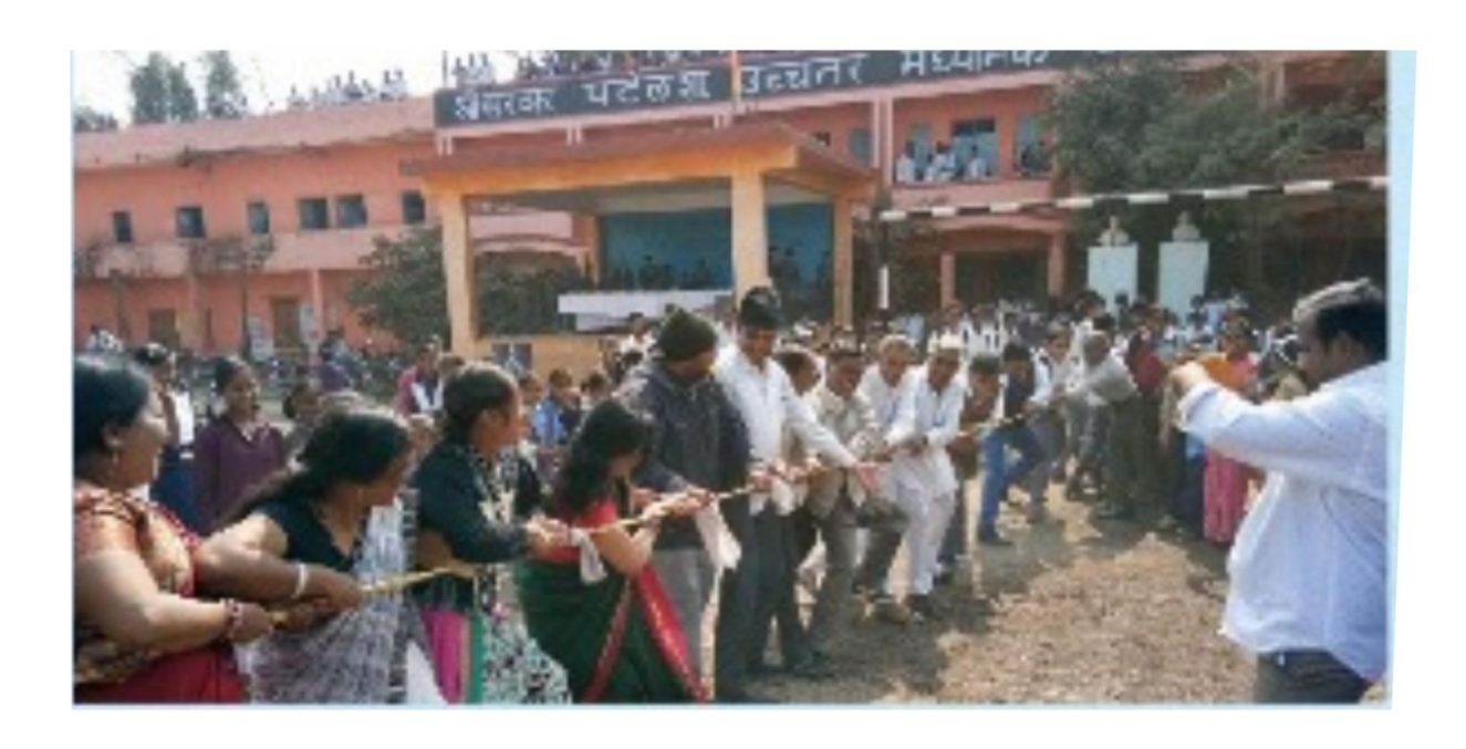
Sport for Unity