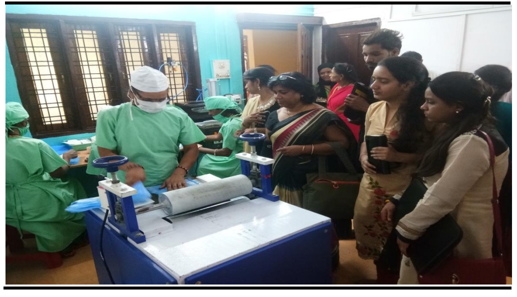
Inauguration of Santinary Towel Unit