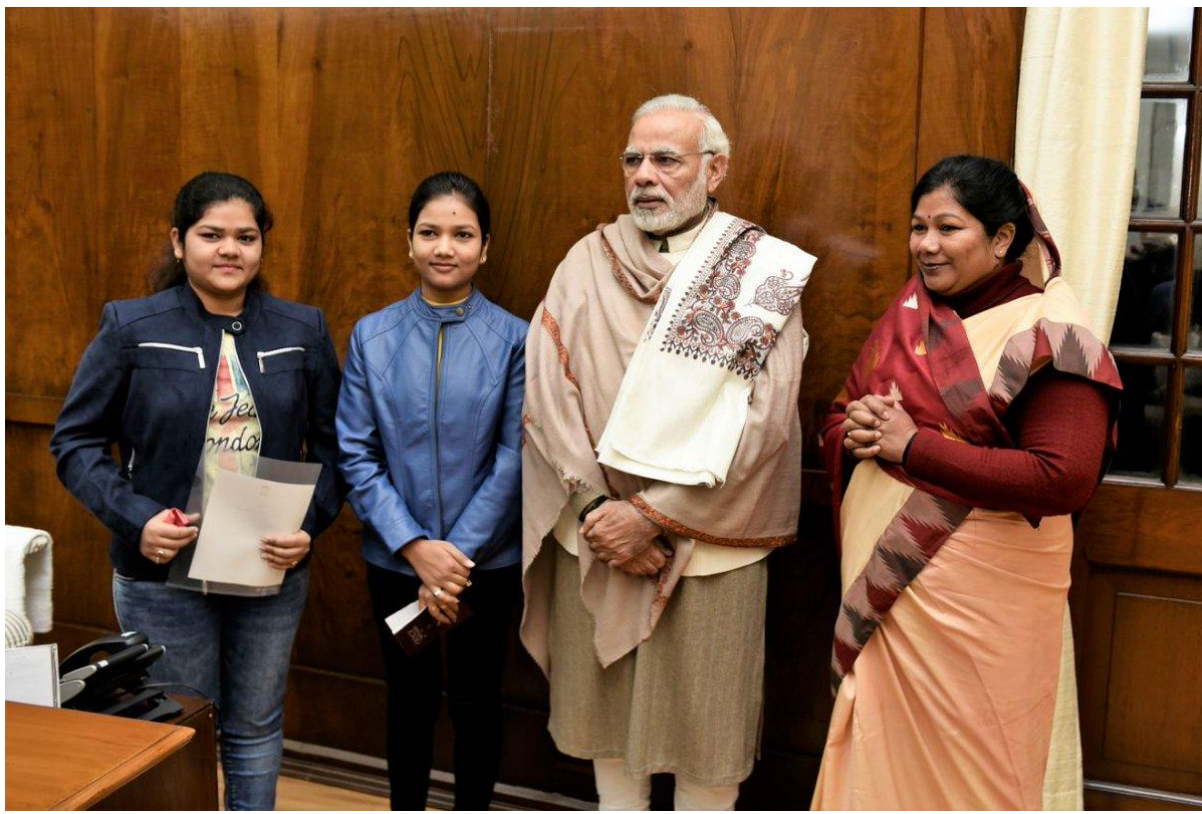
With Hon. Prime Minister