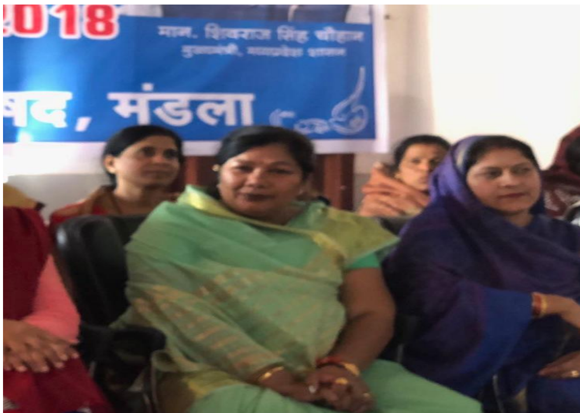
In a public function