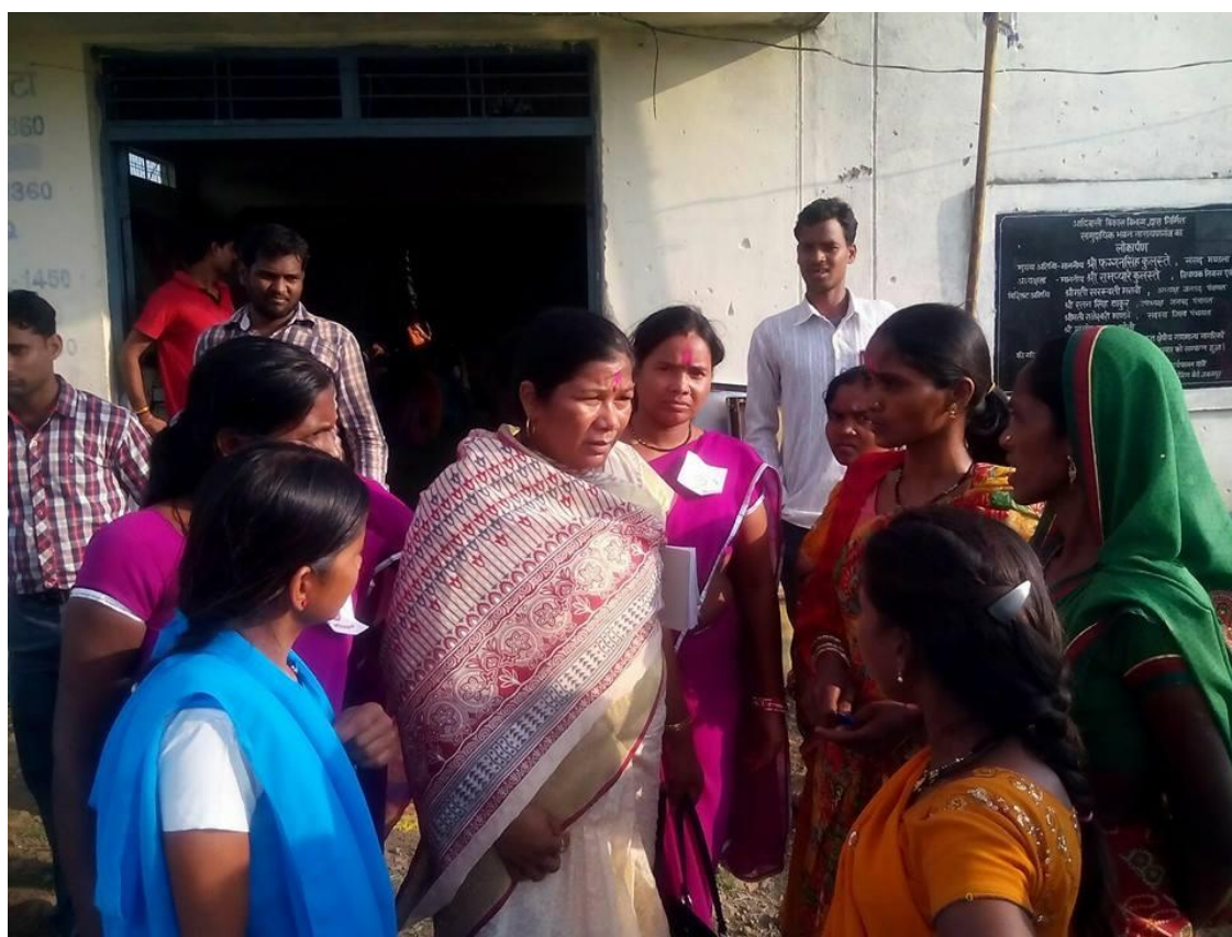
Resolving local women issues