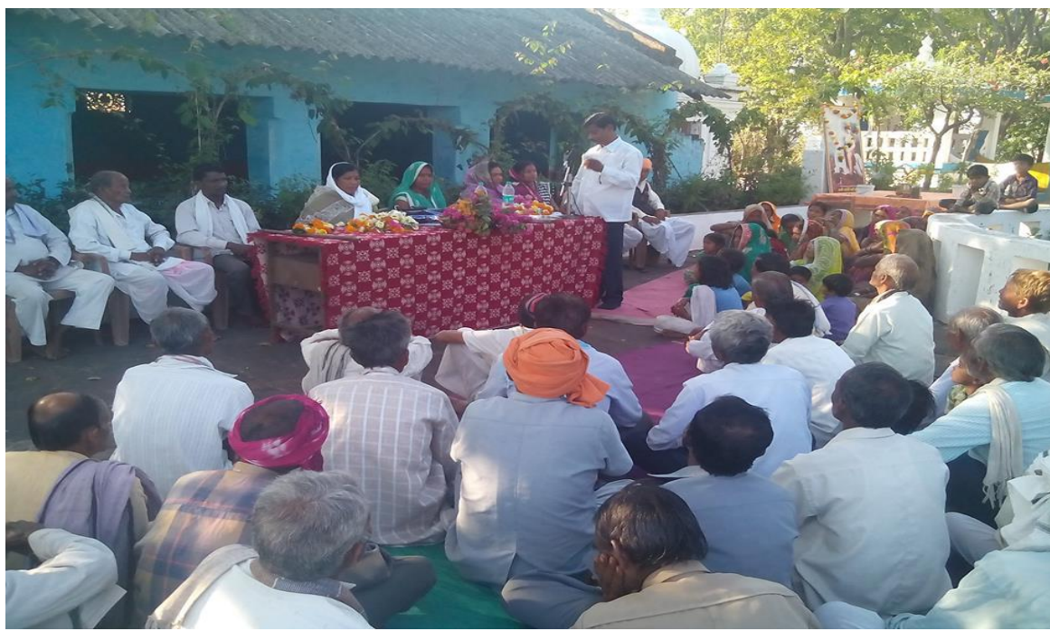
In a gramsabha meeting