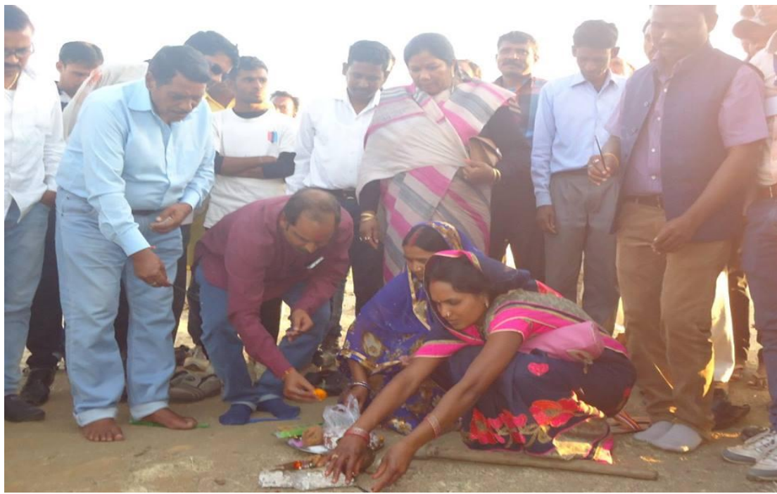
Bhumi Pujan of Development work