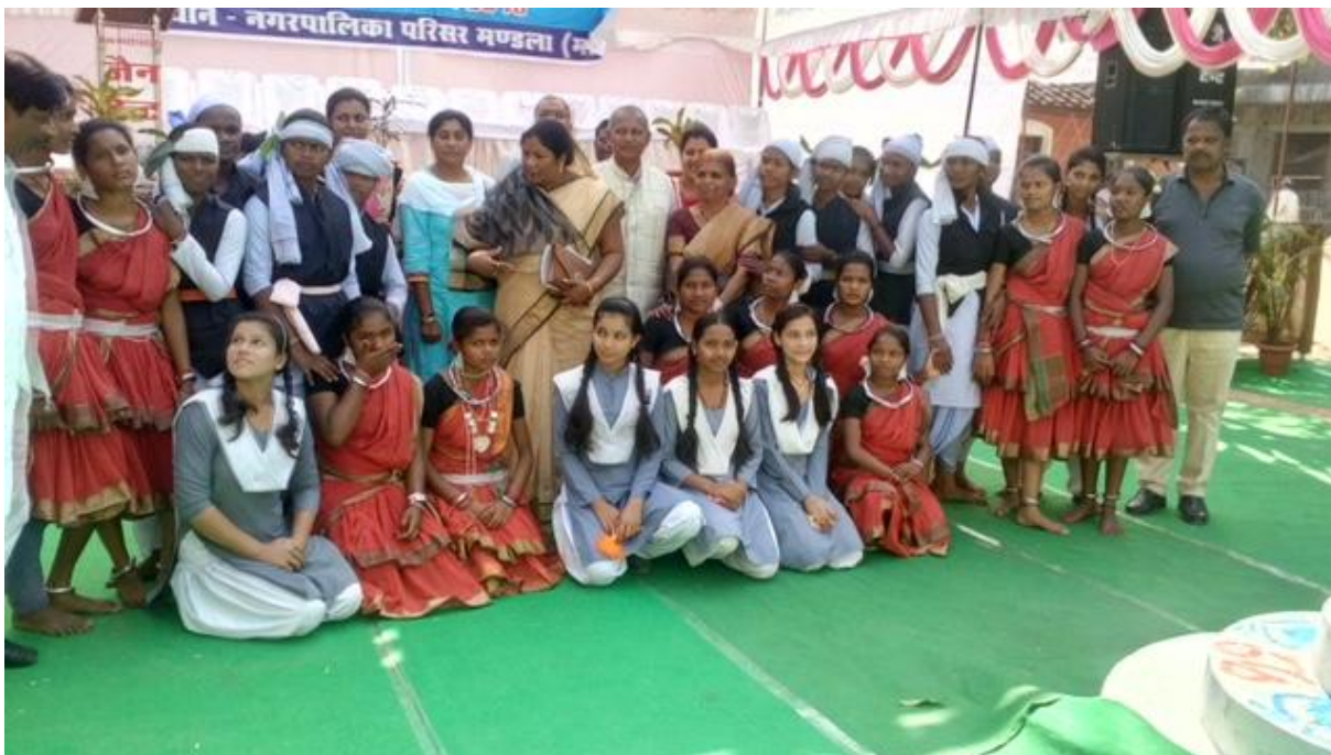
With adolescent girls