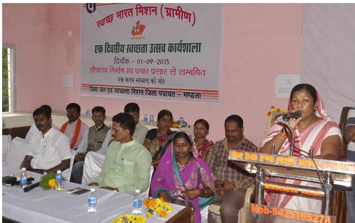
Addressing sanitation workshop