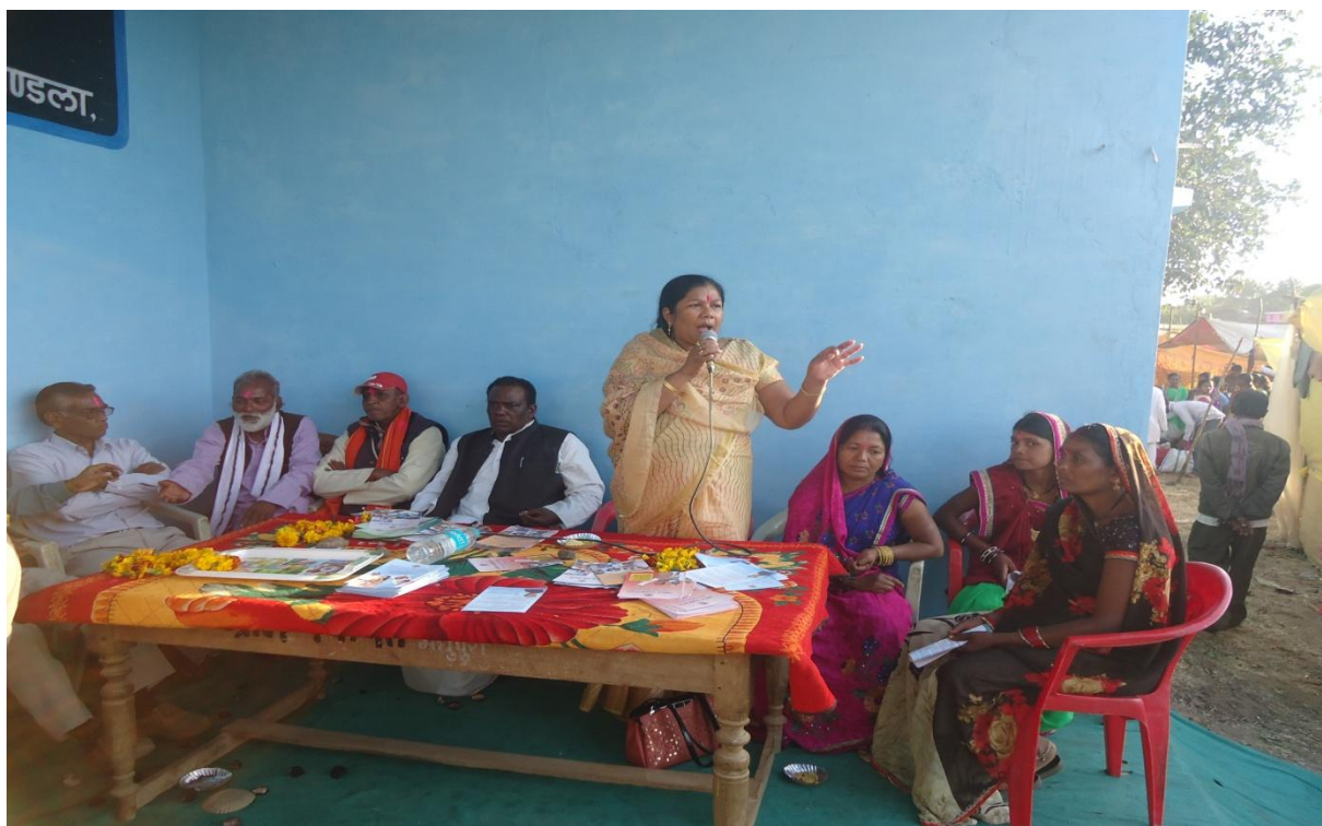
Addressing the local meeting