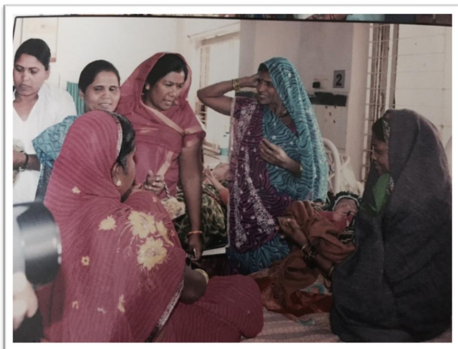
Caring the mal nourished infant