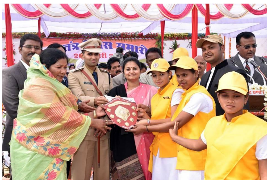
Motivating the Youths