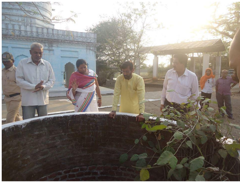
Monitoring development works