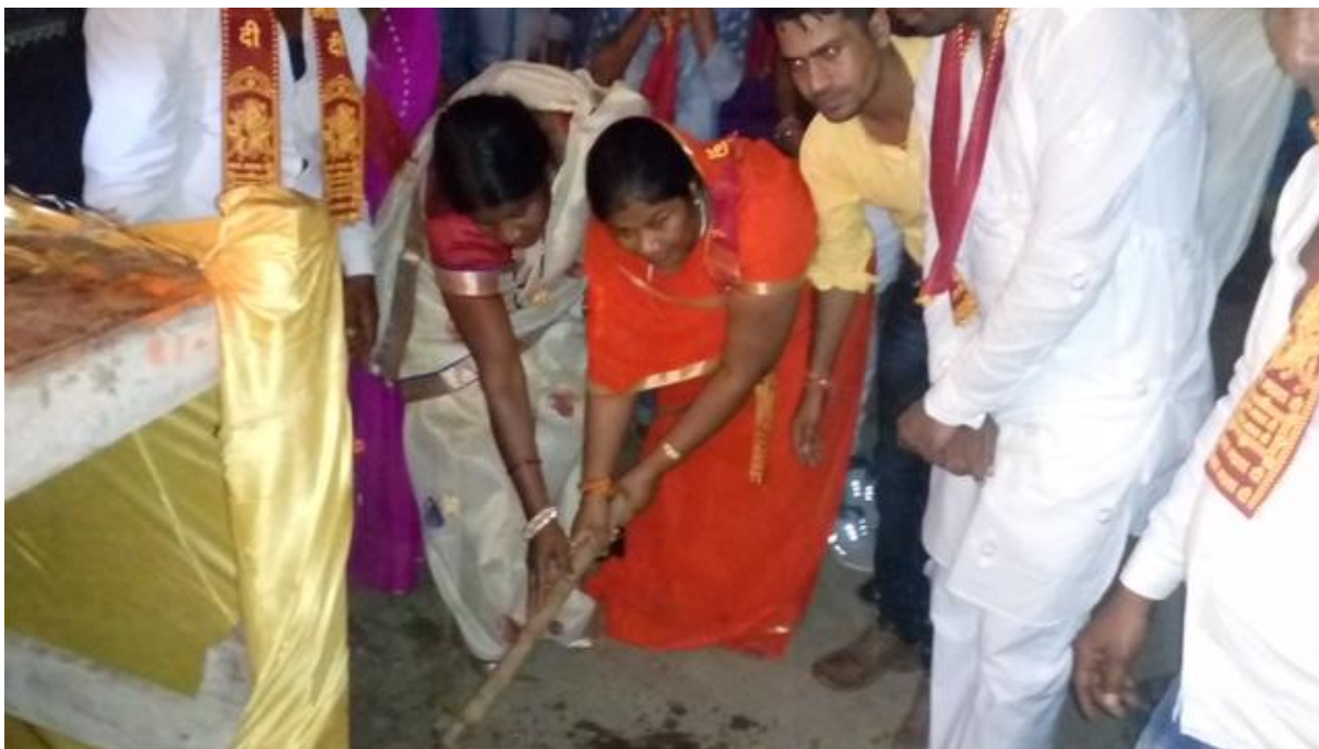
In a Bhumi Pujan