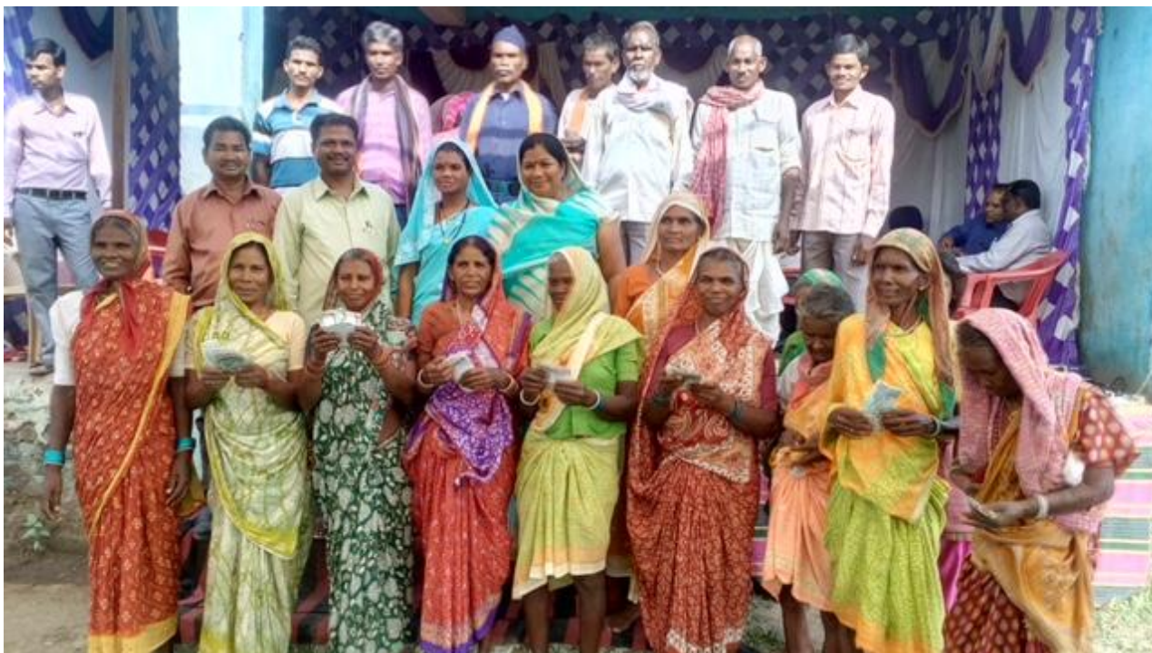
With SHG Members