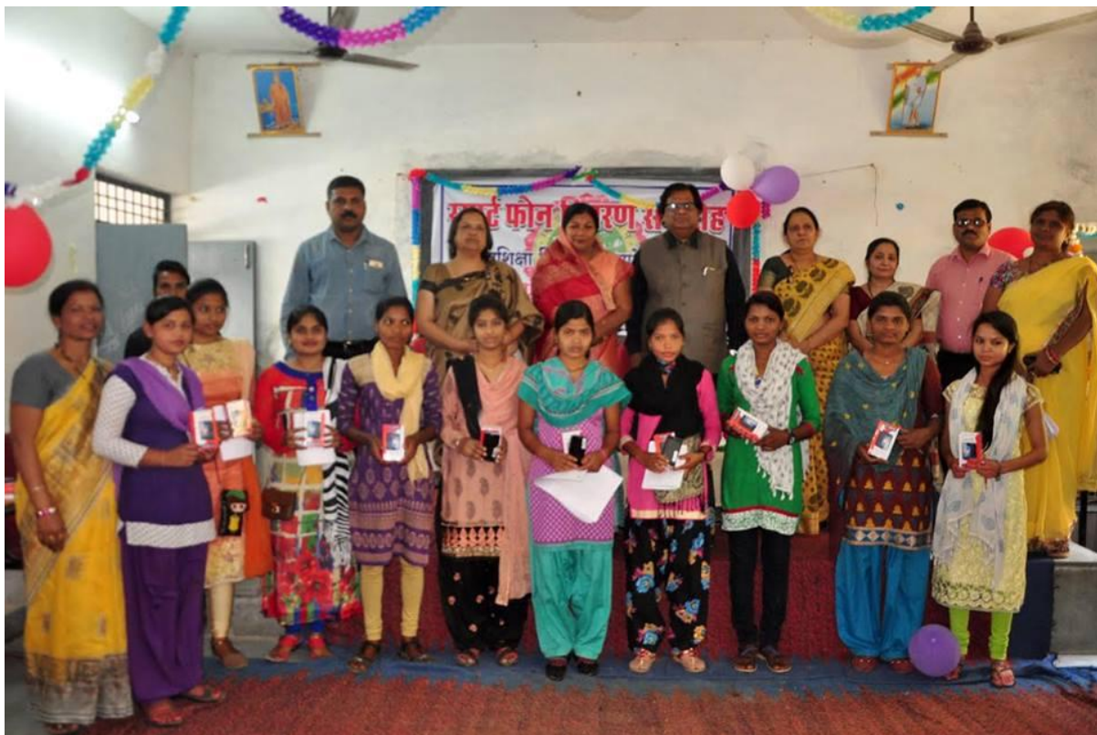
With girls students distribution phones