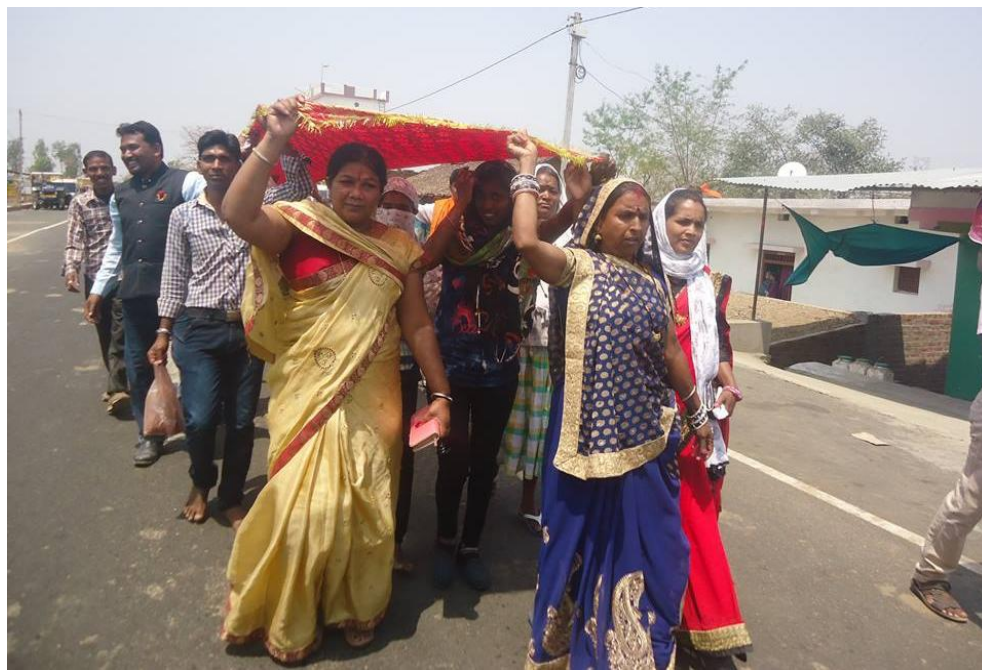
Respection the rituals