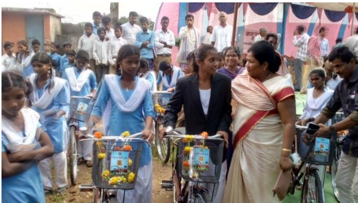
Encouraging girls for Empowerment & Education