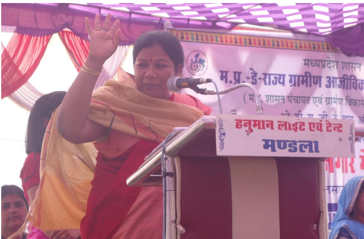
In a livelihood programme