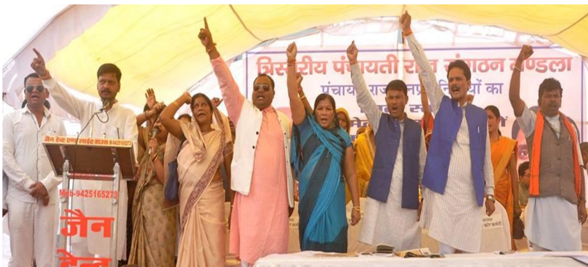
Cheers to Panchayati Raj