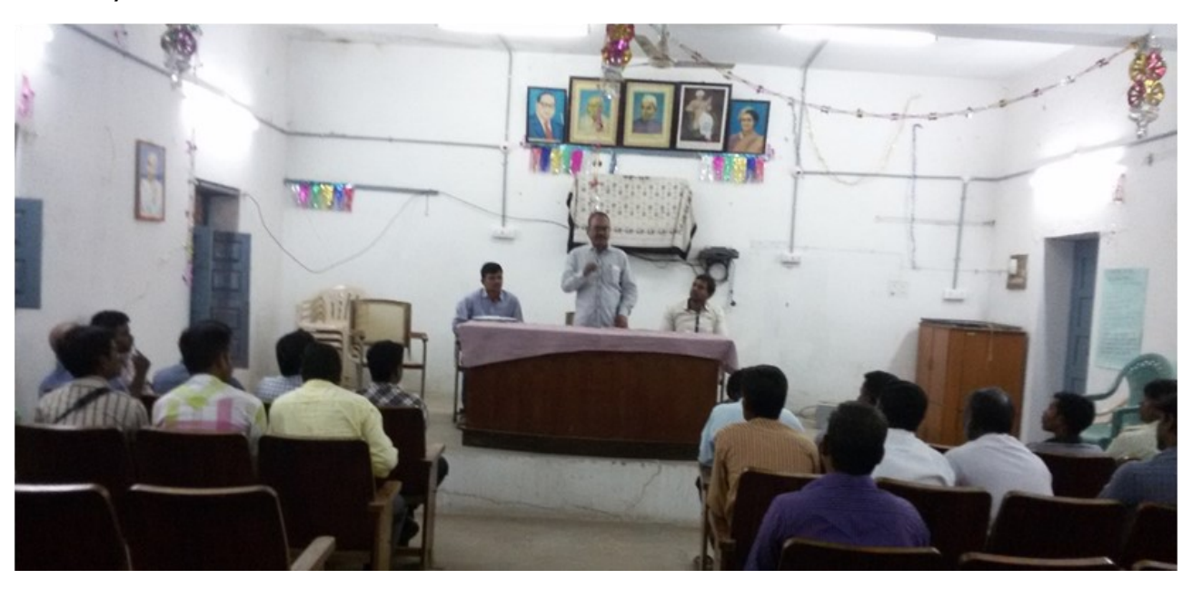
Figure 3.3: Interaction Meeting with Stakeholders

5. Interaction meeting: After completion of VSAs training and before grounding the field activities, SSAAT team conducted an "Interaction Meeting" along with Social Audit team to ground the actual field level Social Audit process with District, Taluk administration officials, IWMP officials and Project Implementation Agency (PIA) (Figure 3.3). In this meeting, SRP from SSAAT explained about the kind of support and cooperation that was expected from the field by the local IWMP staff, PI staff, Gram Panchayat President and members.