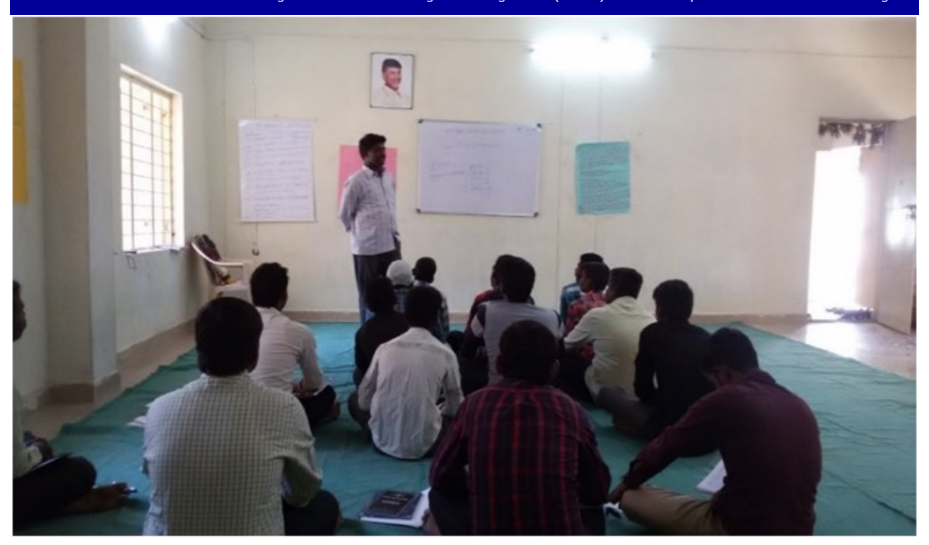
Figure 3.1: Village Social Auditors' Training

4. Consolidation of records and verification: The team verified all the related records available at the project level (Figure 3.2). They cross-checked the given records and the web reports against the total expenditure to ascertain that all the records were handed over to them.