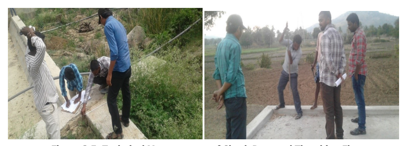
Figure 3.5: Technical Measurement of Check Dam and Threshing Floor