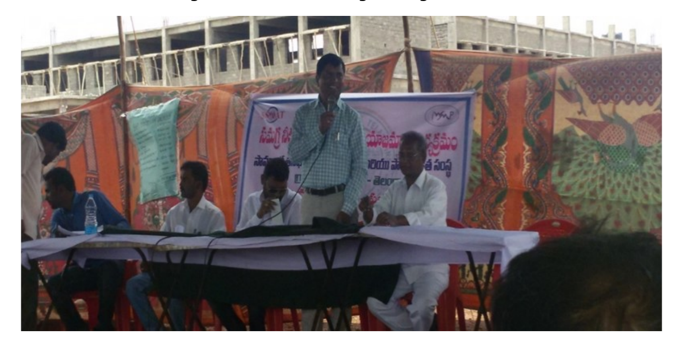
Figure 3.10: Public Hearing at Algole - Telangana