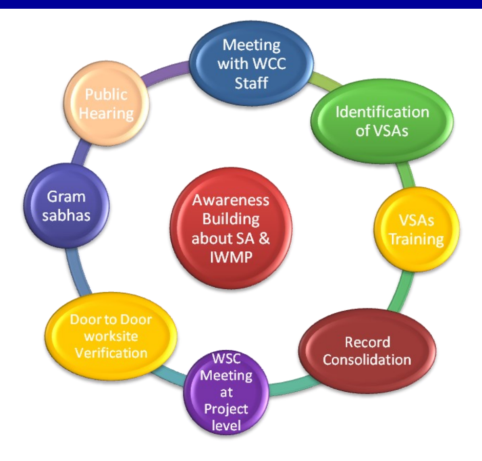
Figure 2.1: Schematic Diagram of IWMP Social Audit Process

The purposes of the current case study on 'Process Documentation of Social Audit in IWMP' are: