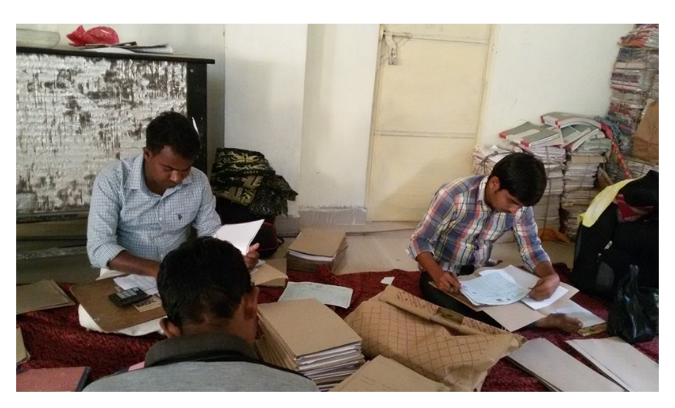
Figure 3.2: Consolidation of Records and Verification by VSA

4. Consolidation of records and verification: The team verified all the related records available at the project level (Figure 3.2). They cross-checked the given records and the web reports against the total expenditure to ascertain that all the records were handed over to them.