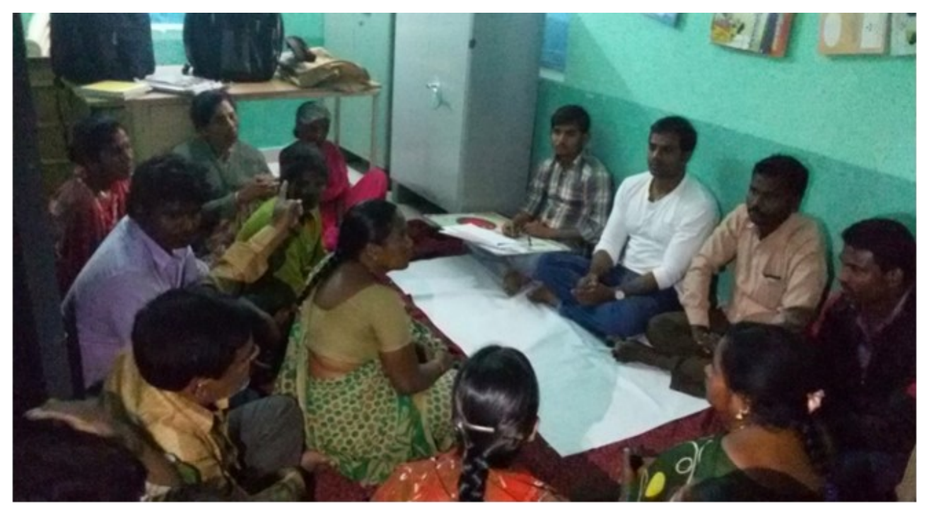
Figure 3.6: Gram Sabha at Netheguttapalli MWS Project

On every issue identified by the Social Audit team, the independent observer recorded, in writing, the evidence of the job card holders, beneficiaries and the version of the persons indicted in the Social Audit. Thereafter, the statement so recorded was read over to the deponent for his/her signature.