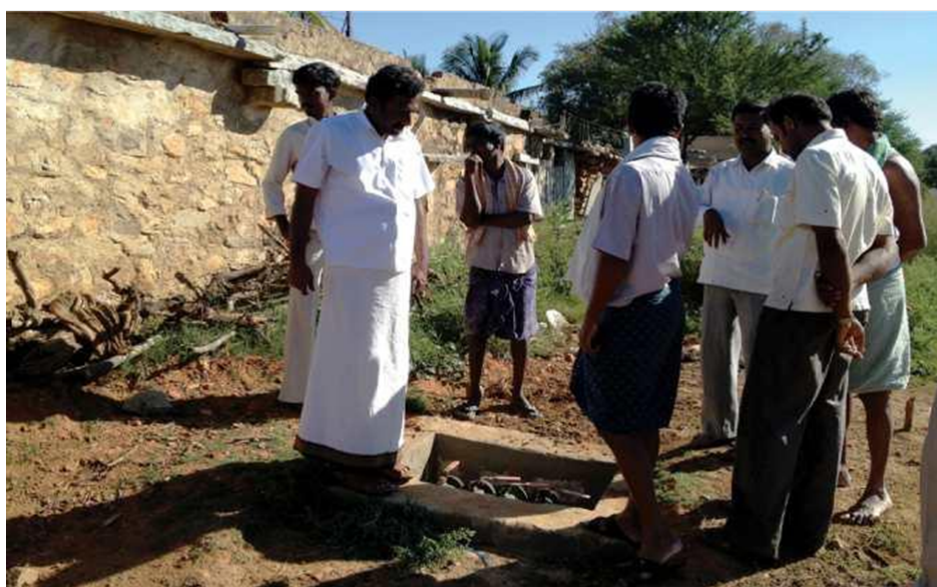
Gram Panchayat Development Officer demonstrating the use of water pump at Dibburhalli Gram Panchayat in Chikkaballapur District, Karnataka