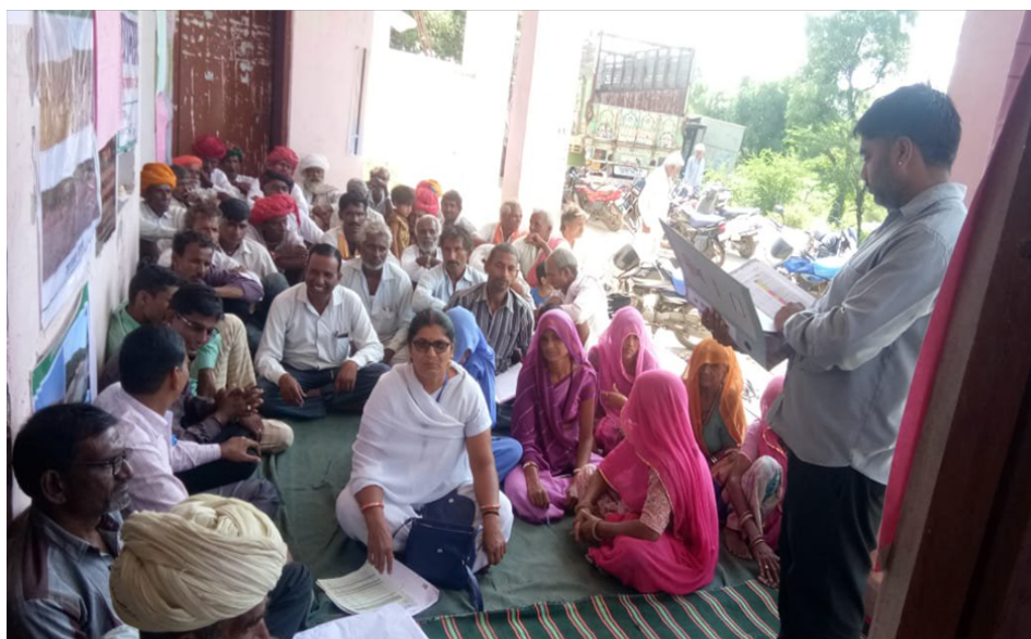
Data collection in progress at Dibburhalli Gram Panchayat, Chikkaballapur District, Karnataka